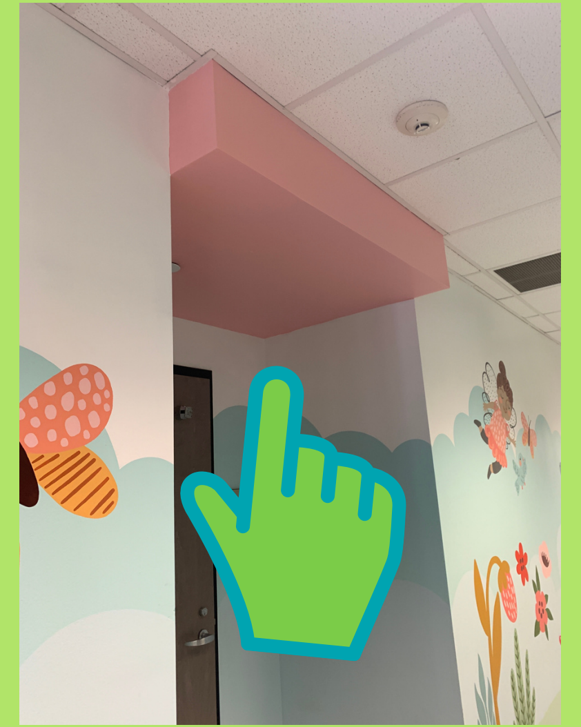
Color Above Door